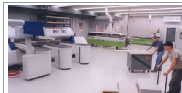
Biesse Canada - BCIT, Vancouver, BC