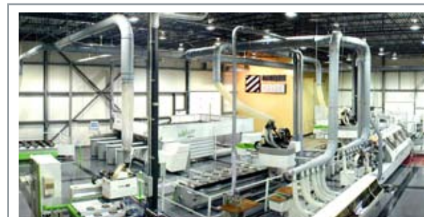
Biesse Canada - Montreal, QC