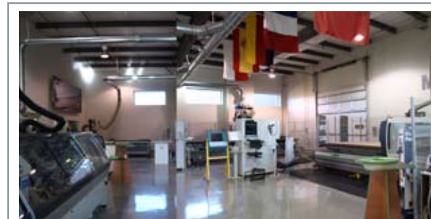
Biesse America - Charlotte, NC

To organize your customized WebEx session please call 877.8.BIESSE.