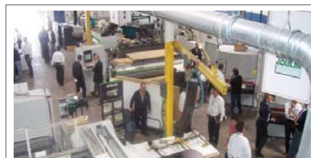
Biesse Canada - Toronto, ON